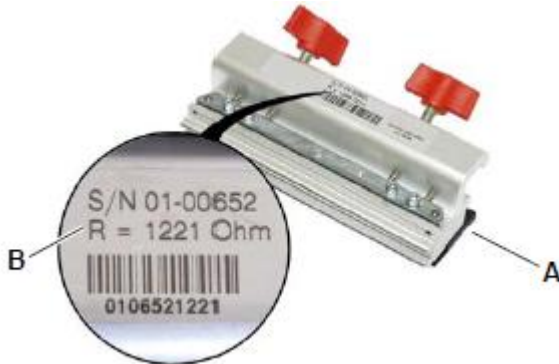
Fig.3. Printhead Resistance Value