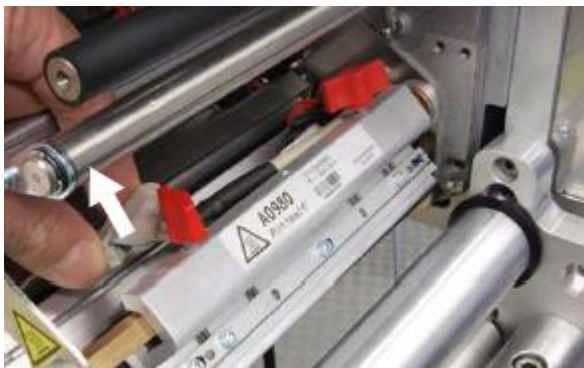
Fig.2. Removal of Printhead Cables